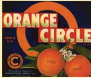
Orange Circle, circa 1940