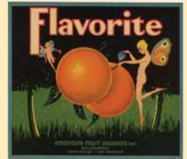
Flavorite, circa 1925-1930