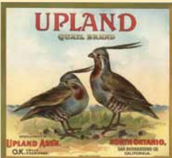
Upland Quail, circa 1905-1915