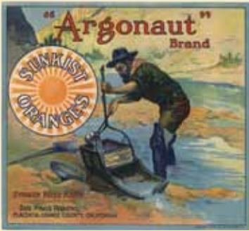
Argonaut, circa 1910-1915