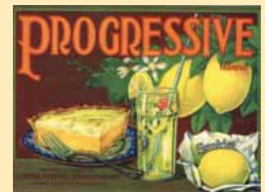
Progressive, circa 1925