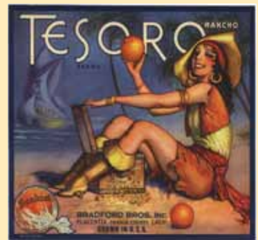
Tesoro, circa 1930-1935