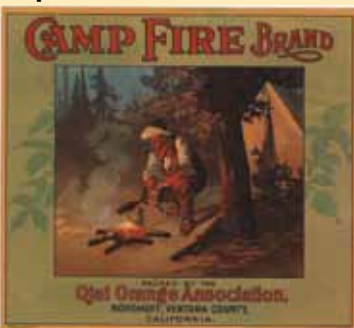
Camp Fire, circa 1905-1910

and many shipments sent east on speculation were left rotting on Midwestern and eastern rail docks.