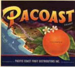
Pac Coast, circa 1935-1940