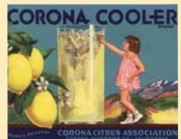
Corona Cooler Lemon, circa 1930