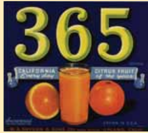
365, circa 1950