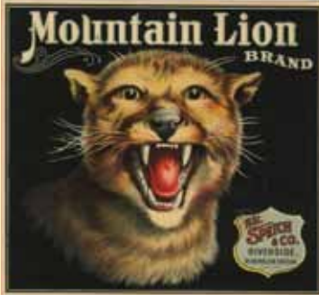
Mountain Lion, circa 1900-1905