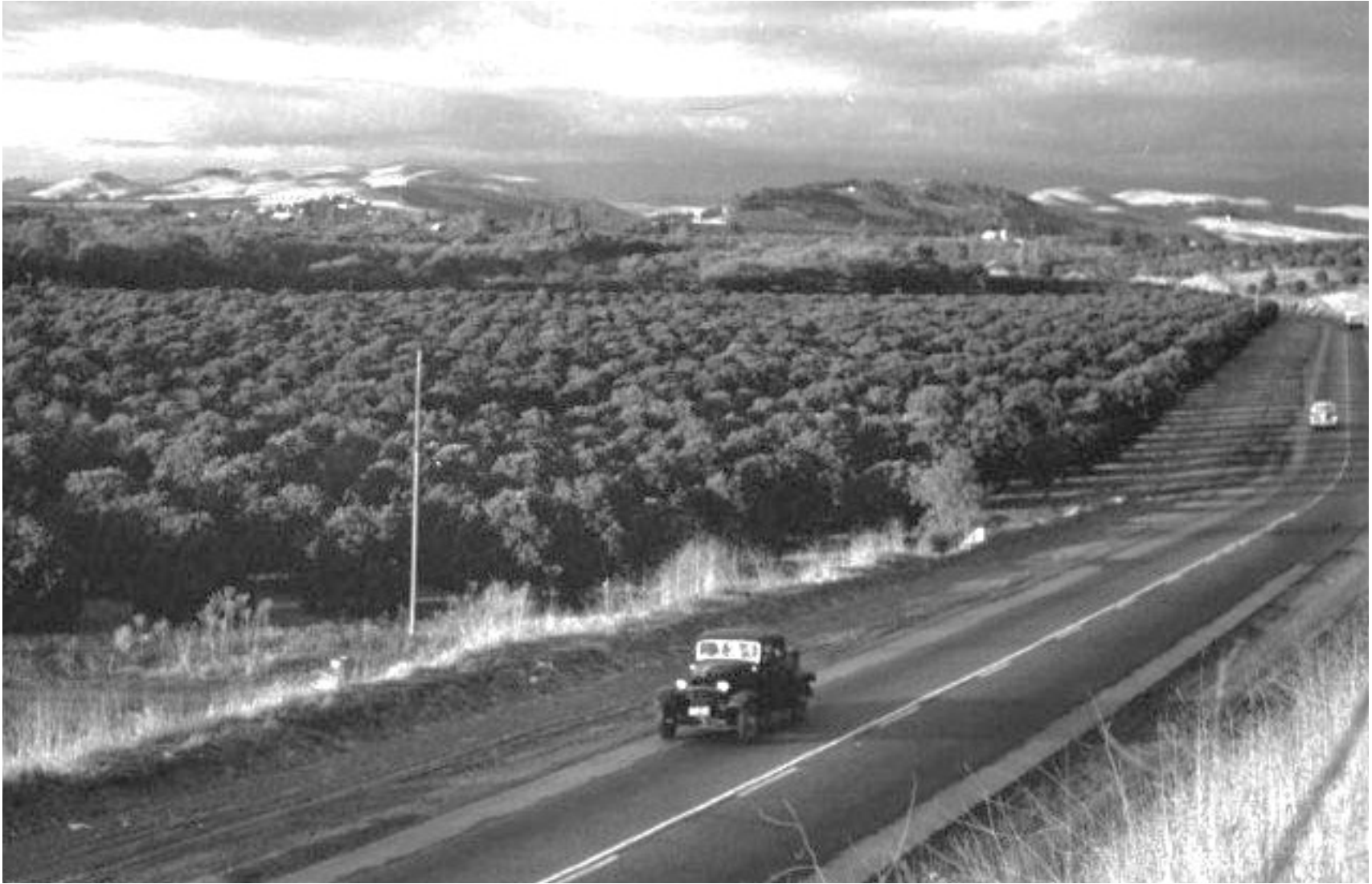
Orange County 1947